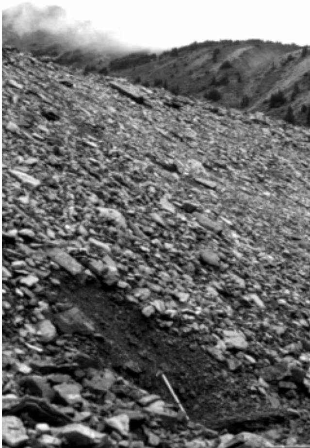
FIGURE 4. Steep frontal margin of the outermost debris complex in the Hilda Glacier forefield. The ice axe sits within our excavation and points downwards to one of the boles recovered from beneath the debris.

Marge frontale escarpée du complexe de débris le plus externe au front du glacier de Hilda. La hache repose dans un des trous creusés dans le cadre de la présente étude et pointe vers un des troncs recouverts de sous les débris.