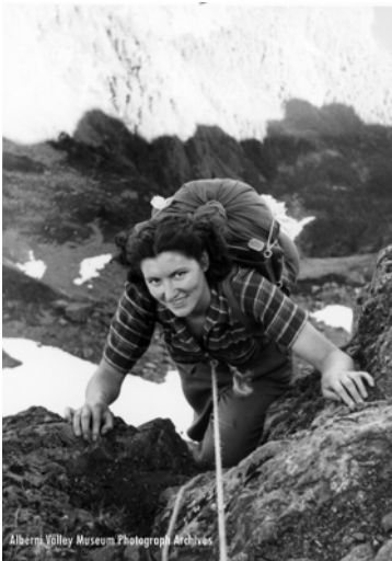
Roped on "the Nose", 1940s