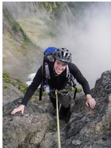
Roped on "the Nose" - youth course, 2004