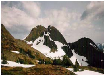
Mt. Arrowsmith from the west