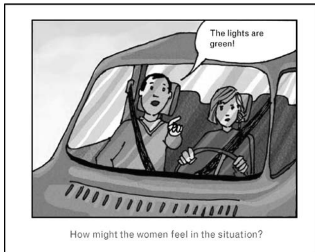
Figure 3 Exercise from module 6

Multiple responses are possible, which is unsatisfactory for patients with a need for closure (e.g. the woman may take the man's words as a mere comment, patronizing behaviour or a command). ('untitled' by Martin Armbruster).