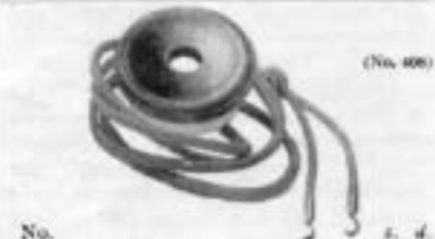
No. 408. Single Telephone Receivers each 18 6