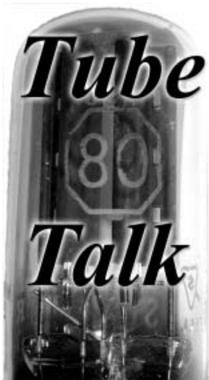
with Neil Sutcliffe, Tube Troll