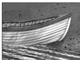
May '98 to Oct '01