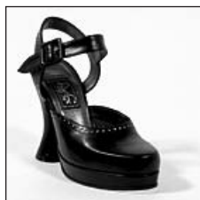
Oct '01 to '03