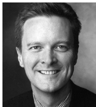
Hon. Colin Hansen, Minister of Economic Development and Minister responsible for the Asia-Pacific Initiative and the Olympics