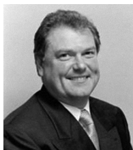
Digby, Lord Jones of Birmingham, UK Minister of State for Trade and Industry