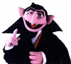
Figure 1 | Count von Count. Note that he is "comprised of triangles and pointy things [that] make [one] uncomfortable" (comment from study participant).

Recent evidence suggests that early life experiences can affect later cognitive functioning, including mathematical aptitude (Aubrey et al, 2003). However, a thorough search of the literature reveals a lack of any investigations into the relationship between childhood fondness for Sesame Street's Count von Count (Figure 1) and mathematical aptitude in later life. This paper, in which we