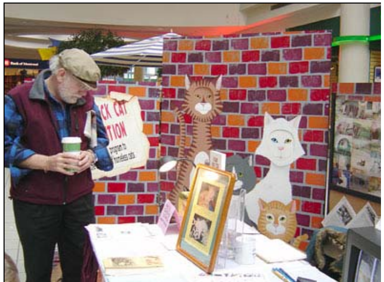
Interested onlooker at the Royal City Centre

Thanks again to all our volunteers who assisted at the event. You're the cornerstone of our organization!