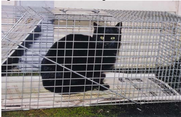
This Maverick Cat will be back home soon.

Trapping took place in barns, warehouses, townhouse complexes and backyards. At the end of the day, through the combined efforts of everyone involved, eighteen cats in total were caught.