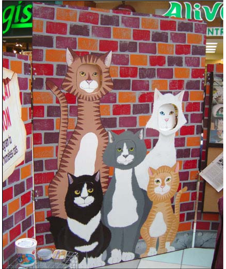
"Peek-a-boo" Maverick Cats in New Westminster