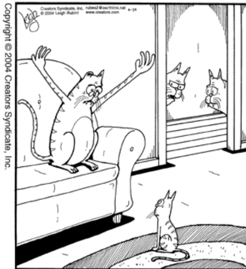
* ... A place called the Magic Kingdom where the mice are as tall as refrigerators?! ... Honestly, George, don't you think it's about time your father lay off the catnip?*