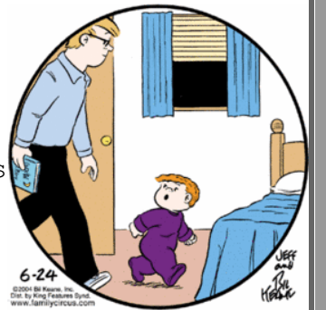
6-24 "I'll never forget what happened today ... or no, I think it was yesterday."

FOCUS Lbydmister (306) 825-7366 focuslb@sasktelnet