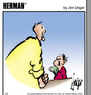
"My report card isn't bad if you consider the genes I have to work with."