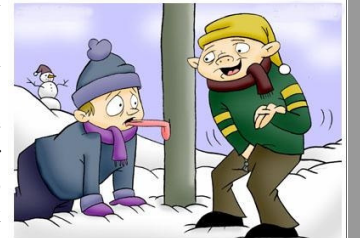
"Don't worry, I can melt your tongue off there. Just hold still..."