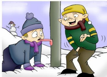
"Don't worry, I can melt your tongue off there. Just hold still..."

Hooray!! Spring has finally sprung and there will be no more of these kinds of embarrassing situations happening to our children.