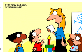
"My name was David, but that sounded old fashioned. So I shortened it to DVD!"

"When you reach for the stars, you may not get one, but you won't come up with a handful of mud either." Leo Burnett