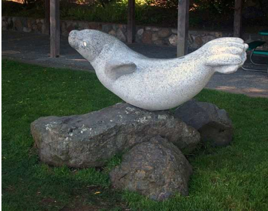
Statue of Popeye at Friday Harbor

The seal is called "Popeye", who has only one eye and is the mascot of Friday Harbour. He swims around the boats a couple of+ times a day looking for handouts. He will use one of his flippers to splash water in order to get your attention. He will only eat fish. We tried to give him some crackers at first but he wouldn't touch them. They also have a statue of Popeye on shore, which has only one eye as well. We had some herring which we hand fed Popeye. (This was a big thrill for all of us).