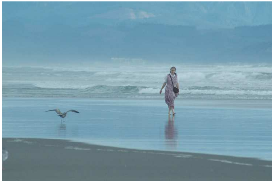
“A walk on the Wet Side”