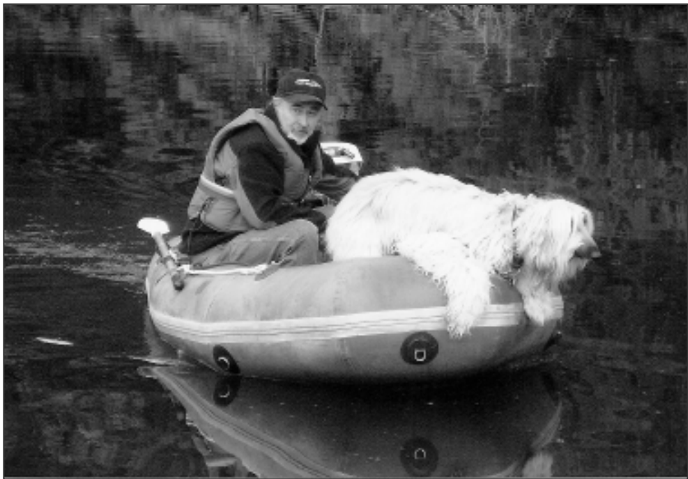
“I think I see it, Dad!!”