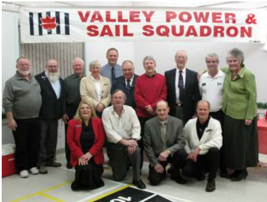
Past Commanders who attended the Celebration

On November 30 th around 1800 hours, over 80 people gathered at Yarrow Community Hall for our annual Christmas Party along with a celebration of the 30 th year since the inception of Valley Squadron. All Past Commanders received a special invitation and Valley was pleased to see more than half of the Past Commanders attending.