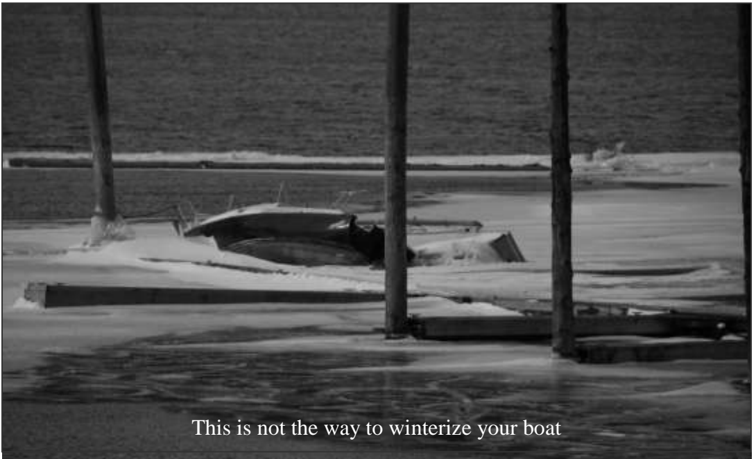
This is not the way to winterize your boat