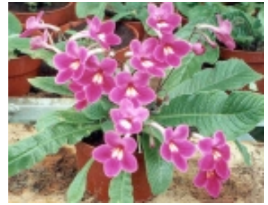
S. 'Hanna Ellis'

Streptocarpus is a Old World genus native to SE Asia, Africa and the island of Madagascar. The genus contains two divisions or sub-genera: streptocarpus and streptocarpella. The sub-genus Streptocarpus is comprised of plants with diverse growth habits ranging from straplike leaves, growing in an irregular rosette (plurifoliate) or as a single leaf (unifoliate). The sub-genus Streptocarpella includes plant material which is caulescent, i.e., growing upright and stemmed.