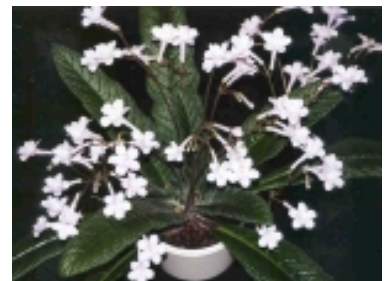
S. 'Lavender Rosette'

Asexually using leaf segments & crowns or sexually (seed) through self or cross pollination. Hybrid plant material will only reproduce true using asexual propagation methods and techniques.